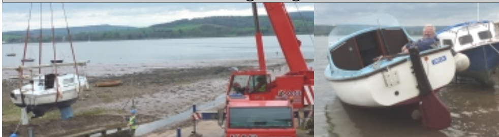
^ First craning 1530