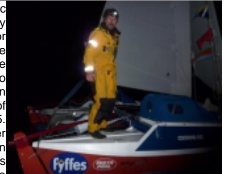
First contact 2227 2/8/10 3½ miles SE Exmouth