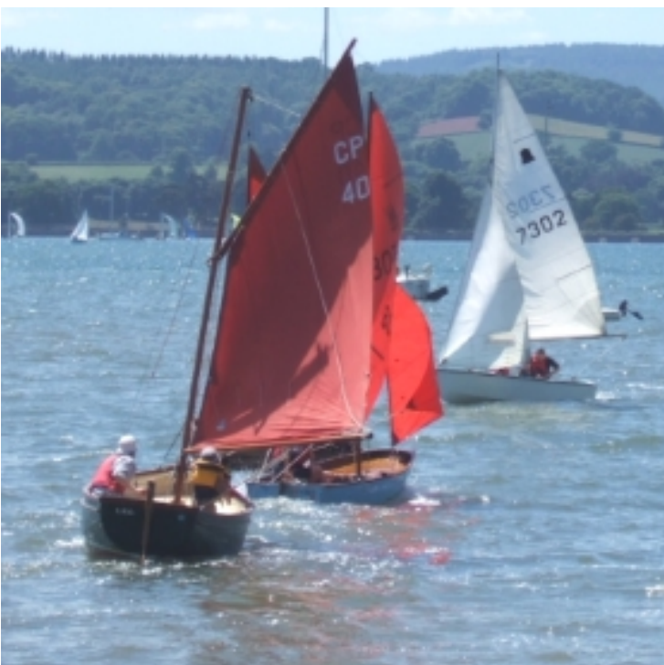
Kids' Fun Sail — see p.3

• Apologies for no images from the Honda RYA Youth Rib Championship this month—failure of the mains power supply to my main laptop meant that I could not access the files before going-to-print deadline.