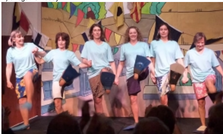
'The Flippers' a joyous 5-minutes of entertainment by another act at

The Commodore & his lady are hosting an Italian Supper evening on Saturday 13 th March. Numbers are limited to 40, so sign-up to the Notice in the Club as soon as possible please.